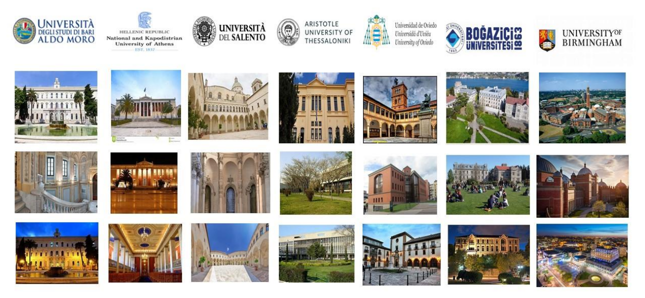
Welcome to the TEP III postgraduate symposium 2025

Note: UK starts at 8:00, Italy starts at 9:00 am, Greece starts at 10:00 am, Turkey, starts at 11.00 am